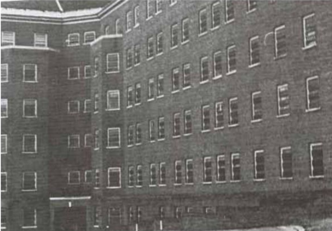
Image used with permission by the Center on Human Policy at Syracuse University; Christmas in Purgatory , 1974